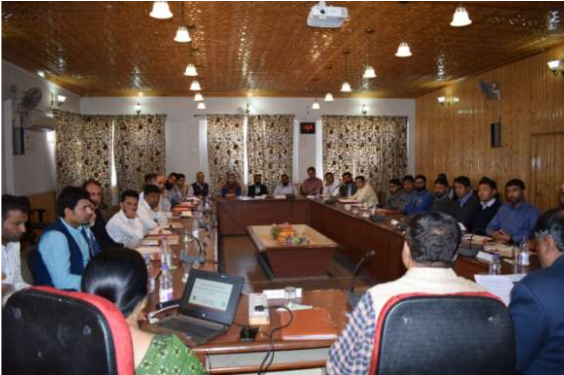
A view of inaugural function of COMMIT on 4 th October, 2018 at IMPARD Srinagar