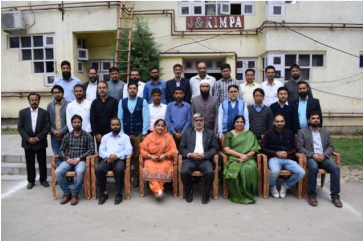
Group Photograph of Trainees of ToT Workshop on COMMIT at IMPARD Srinagar.