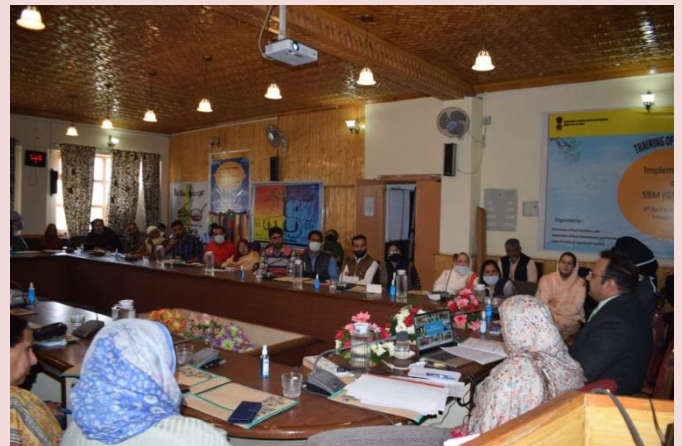
UNICEF Team Interacting with JKAS Officer Trainees April 04, 2022