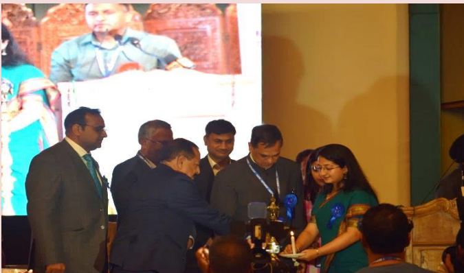
The Hon'ble MoS lighting the Ceremonial Lamp

The formal inauguration ceremony started with the recital of the National Anthem – Jana Gana Mana .