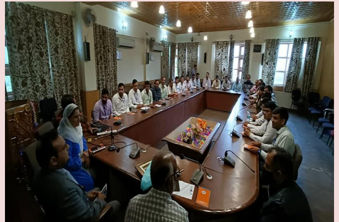
Training Course for Officers of Excise & Taxation Department, Haryana, held at IMPARD, Srinagar, w.e.f. April 17-20, 2022