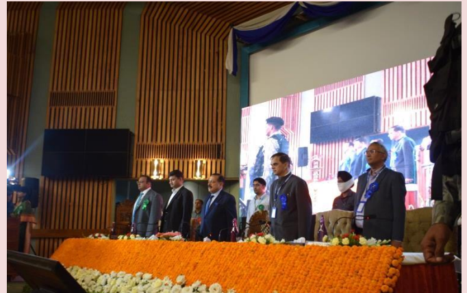
National Anthem, Jana Gana Mana , being played at the Regional Conference on "Bringing Citizens and Government Closer through Administrative Reforms" held at SKICC, Srinagar, on May 16-17, 2022