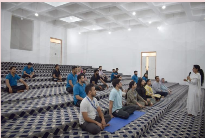
JKAS Officer Trainees participating in Yoga Session held under the auspices of The Art of Living Foundation