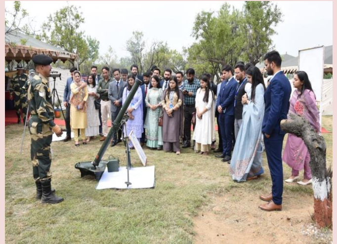
JKAS Officer Trainees of Batch-2020 during Army Attachment