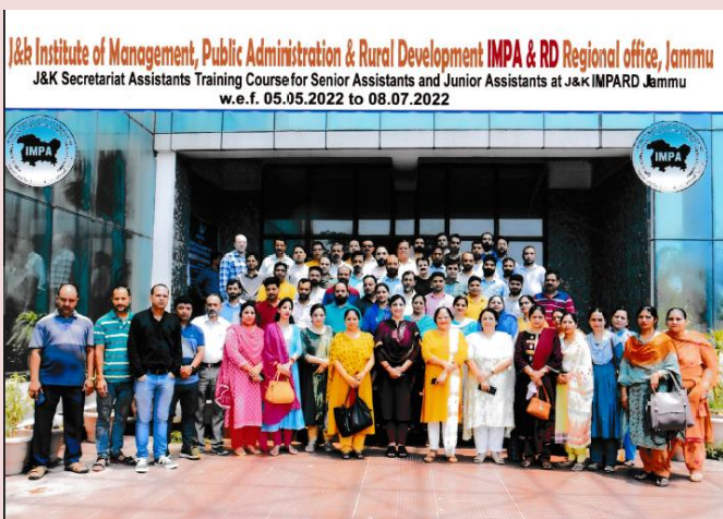
"Secretariat Assistants Training Course" held at IMPARD Regional Centre Jammu w.e.f. May 05, 2022