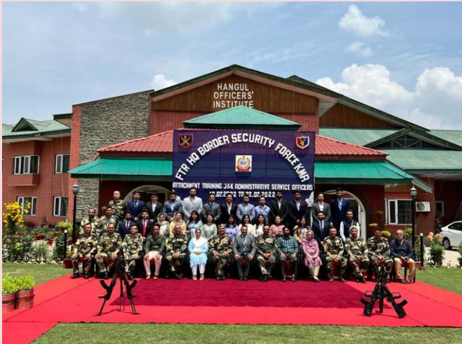
JKAS Officer Trainees of Batch-2020 during Army Attachment