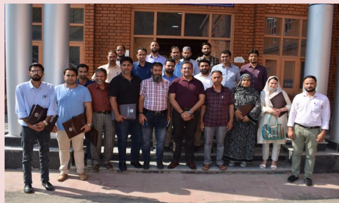
Training Course on "Post-Disaster Rehabilitation and Reconstruction" held at IMPARD Main Campus, Srinagar, w.e.f. June 27-29, 2022