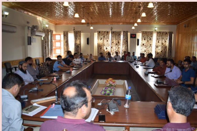
Orientation Programme on Redressal of Public Grievances, held at IMPARD Main Campus, Srinagar, w.e.f. June 28-29, 2022