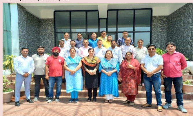
Training Course on "Swachh Bharat Abhiyan in Urban Areas" held at IMPARD Regional Centre, Jammu, w.e.f. June 06-08, 2022