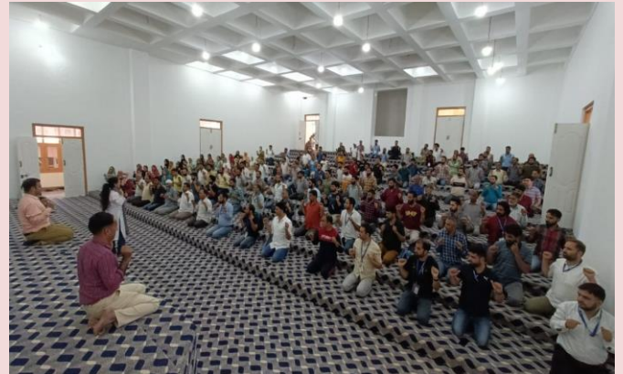
Trainee participants of Secretariat Assistants Training Course participating in Yoga Session held under the auspices of The Art of Living Foundation