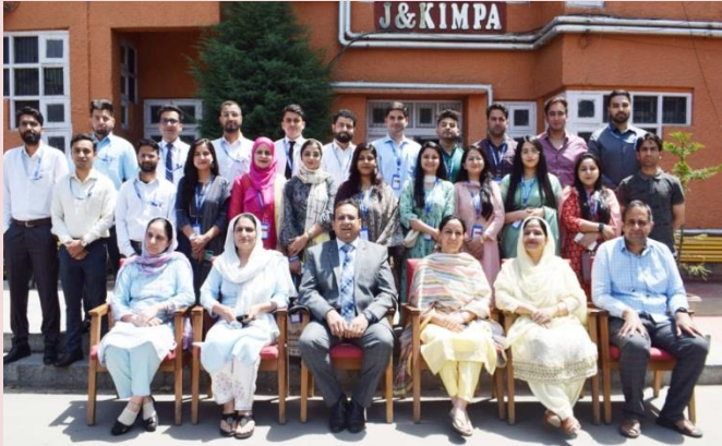
Phase-I of Professional Training of JKAS Officer Trainees Batch-2020