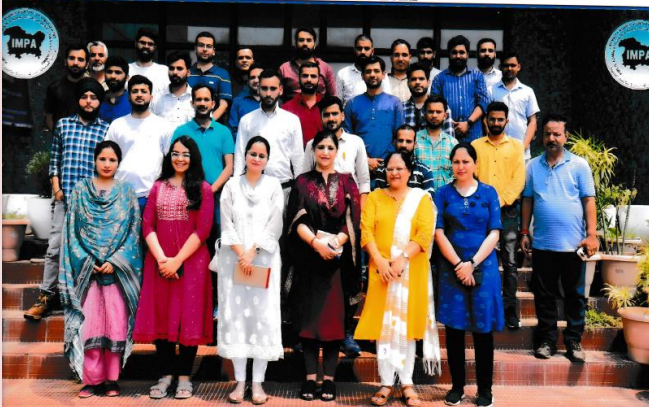
Institute of Management, Public Administration & Rural Development IMPA & RD Regional office, Jammu Three Days Training Programme on Financial Management for Panchayat Officials of Samba & Udhampur District w.e.f 27 to 29 June 2022