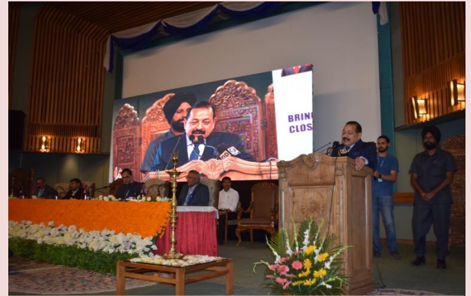
Hon'ble MoS, PMO, Dr. Jitendra Singh, addressing the Conference, May 16, 2022

He said that India is in its 75 th year of independence. This is the time to look 25 years ahead and to visualize what sort of country India should be in 2047.