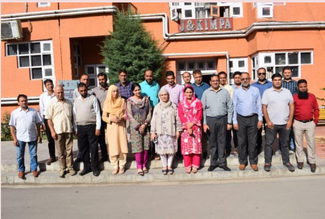
Training Course on "Sustainable Urban Transport" held at IMPARD Main Campus, Srinagar w.e.f. May 30 to June 03, 2022