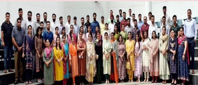
JKAS Probationers at J&K IMPARD, Regional Centre, Jammu

These Training Courses were also evaluatory in nature.