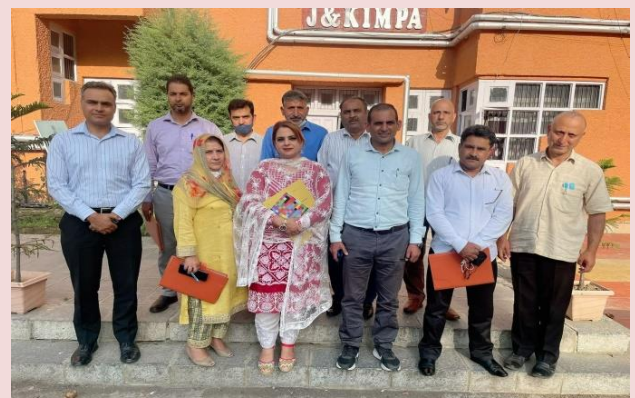
Training Course on SBM ODF (Plus) held w.e.f. July 05-09, 2021, at IMPARD Srinagar