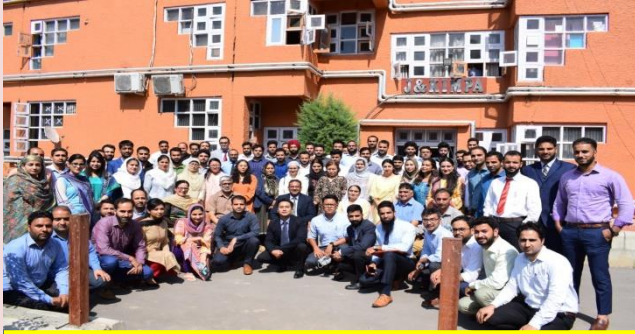
JKAS Probationers at J&K IMPARD, Main Campus, Srinagar