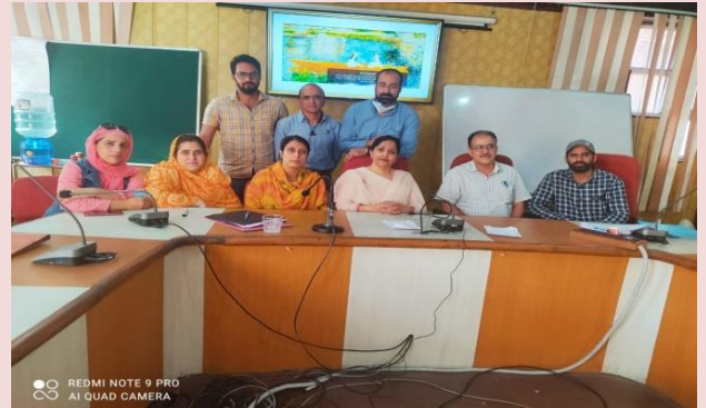
Training Course on “Life Style Skills” held w.e.f. August 09-13, 2021, at IMPARD Main Campus, Srinagar

The Training Course was all about the Art of Better Living even when the work is stressful in these Covid-19 Pandemic times.