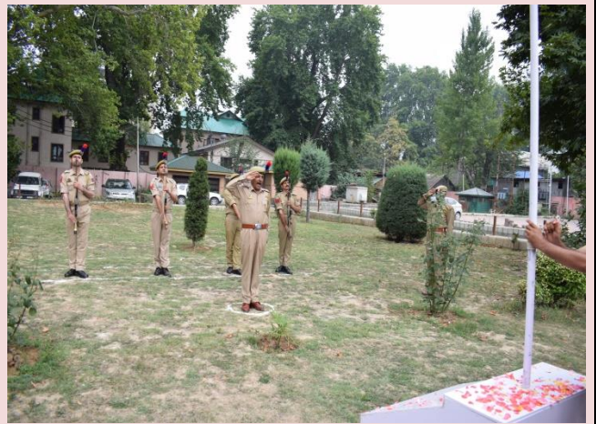
JK Police personnel presenting Guard of Honour on Independence Day 15 th August 2021, at IMPARD, Srinagar