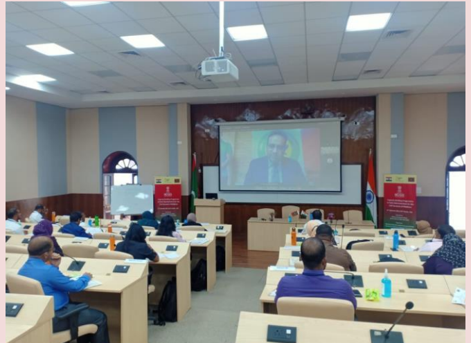
Shri Saurabh Bhagat, IAS, DG, J&K IMPARD, conducting Online Training Session on Motivation for Mid-Career Bureaucrats of the Neighbouring Country of Maldives on September 28, 2021

Shri Saurabh Bhagat, IAS, Director General, J&K IMPARD, conducted, on September 28, 2021, an online training session on "Motivation for Mid-Career Bureaucrats" of the Neighbouring Country of Maldives. This was part of Capacity Building Programme in Field Administration" for the civil servants of that country. The Training Programme was sponsored by Ministry of External Affairs, Government of India, and was organized by Government of Maldives in collaboration with National Centre for Good Governance (NCGG) and Lal Bahadur Shastri National Academy for Administration (LBSNAA). A total of thirty bureaucrats from various Departments of Government of Maldives participated.