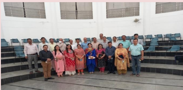
Training Course on “Financial Management for Higher Education” held w.e.f. July 05-09, 2021, at IMPARD Regional Centre, Jammu