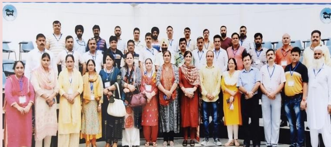
Secretariat Assistants Training Course for Senior Assistants of Civil Secretariat conducted from July 01 to August 31, 2021 at IMPARD Regional Centre, Jammu