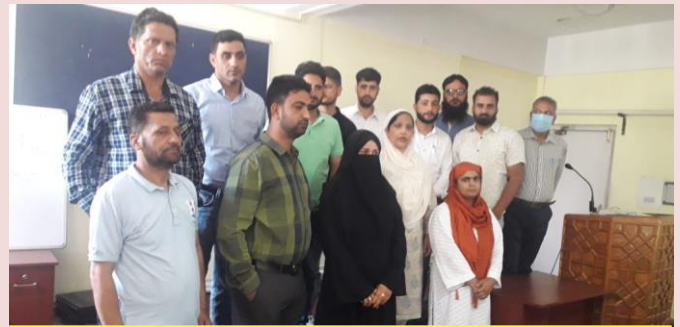
Training Course on COMMIT held w.e.f. July 05-06, 2021, at IMPARD Srinagar

following dates: June 30-July 01; July 05-06; July 07-08; July 12-13; July 14-15; July 26-27; July 28-29; September 20-21; September 22-23; September 27-28; and September 29-30.