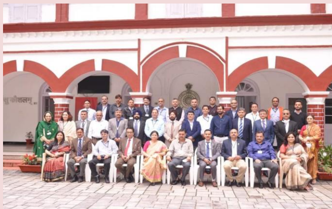
Mid-Career Capacity Building Training for Senior JKAS Officers held from August 21 – 30, 2021, at LBSNAA

Concurrently, J&K IMPARD adopted New Training Policy for Jammu and Kashmir Administrative Services (JKAS) officers. Under this policy IMPARD organised "Mid-Career Capacity Building Training" for the first batch of thirty senior JKAS officers of 1999 batch at Lal Bahadur Shastri National Academy of Administration (LBSNAA), Mussorie, from August 21-30, 2021. The Training was focussed on Public Policy, Ethics in Administration, Health Governance, Land Acquisition, Climate Change, Electoral Reforms, Smart City, and Urban Housing.