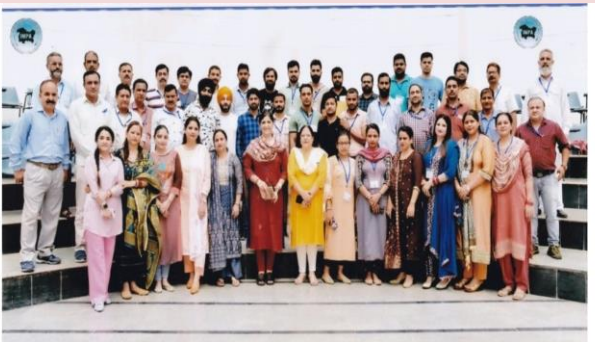
"Secretariat Assistants Training Course for Junior Assistants" held w.e.f. July 01 to August 31, 2021, at IMPARD, Jammu