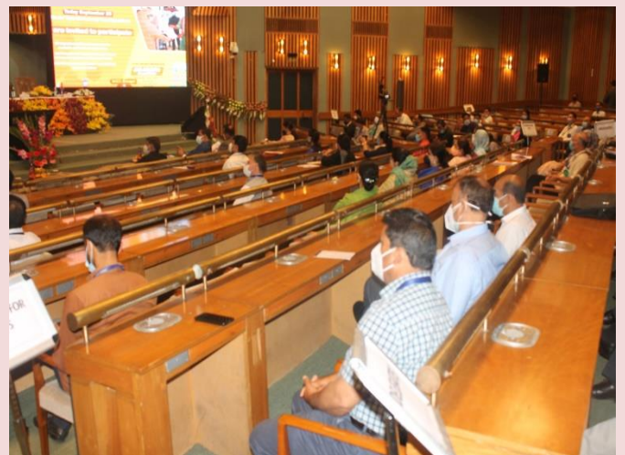
Regional Conference on “Replication of Good Governance Practices” held from July 01-02, 2021, at SKICC, Srinagar