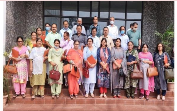
Training Course on "Innovations in Rural Education" held w.e.f. July 14-16, 2021 at IMPARD, Jammu