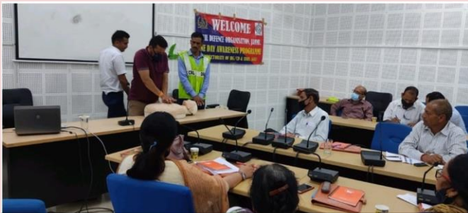
Training Course on "Role of Panchayati Raj Institutions in Disaster Management" conducted from October 04-07, 2021, at IMPARD, Jammu