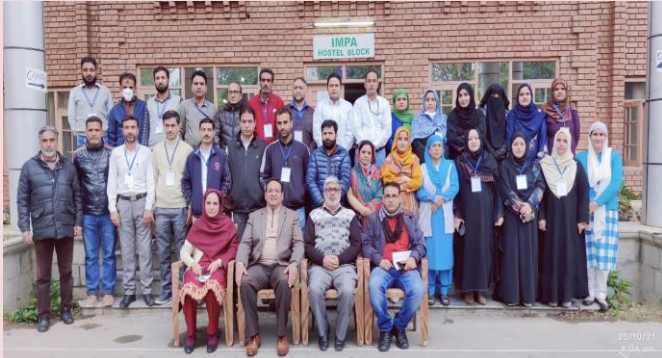
Secretariat Assistants Training Course for Sr. Assistants of SKIMS Srinagar, held from September 06 to November 05, 2021, at IMPARD, Srinagar