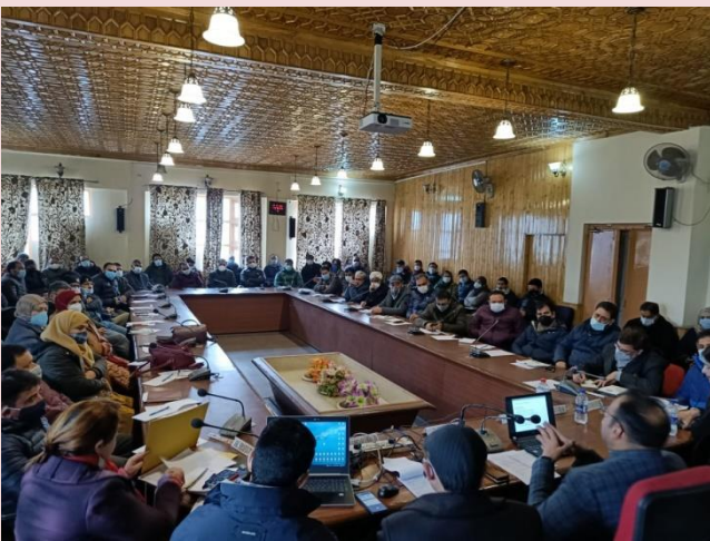
Orientation Programme on Redressal of Public Grievances conducted at IMPARD Srinagar on December 27, 2021