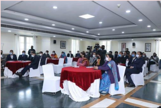
Mid-Career Capacity Building Training for Senior Officers of J&K Government conducted from December 13 – 24, 2021, at LBSNAA, Mussorie