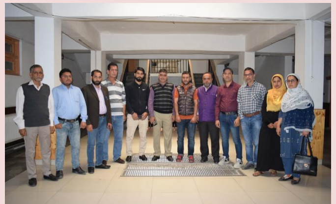
Training Course on "Service Rules and Regulations in Government" conducted from October 05-09, 2021, at IMPARD Srinagar