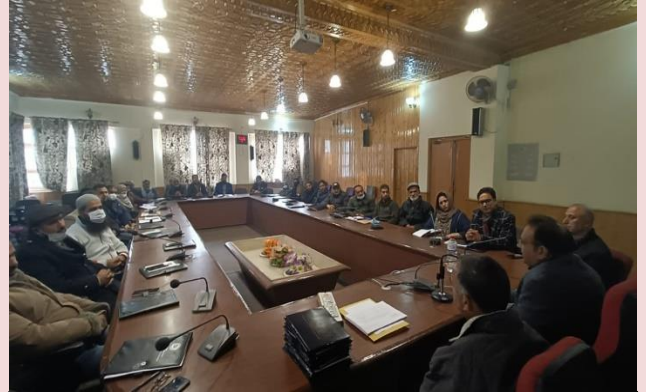
Training Course on "Mainstreaming Disaster Management" conducted from November 22-24, 2021, at IMPARD Srinagar