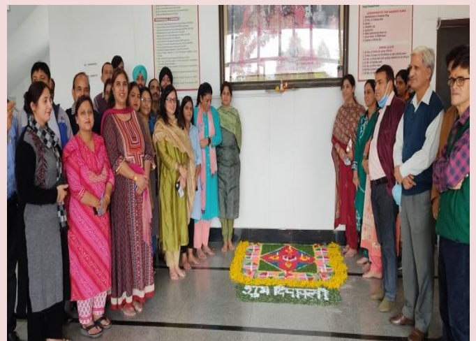
Dipawali, the Festival of Lights, being celebrated on November 03, 2021, at IMPARD Jammu