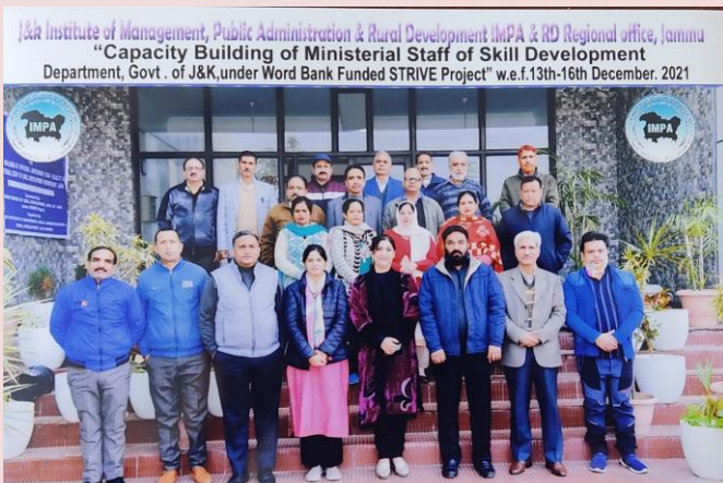
Training Course on "Capacity Building of Ministerial Staff of Skill Development Department" conducted at IMPARD Jammu