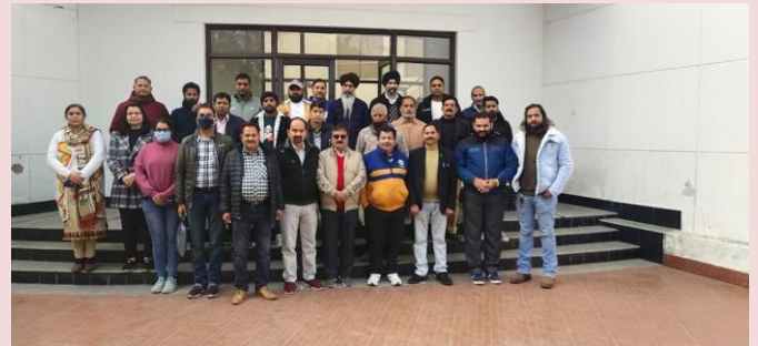
Training Programme on “Urban Solid Waste Management” conducted from December 29-31, 2021, at IMPARD Jammu