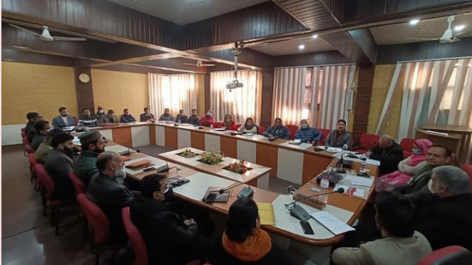
Training Course on “Sustainable Development Goals and Gram Panchayats” conducted from November 22 – 24, 2021, at IMPARD Srinagar