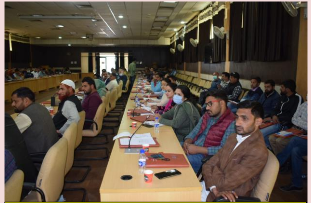
Off-campus training programme on Budget Formulation in Gram Panchayats organised on November 15, 2021, at Reasi by IMPARD Jammu