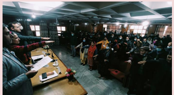
Officers and Trainee Participants reciting the Preamble of the Constitution of India on Constitution Day

On November 26, 2021, J&K IMPARD celebrated the Constitution Day – (also known as Samvidhan Divas in Hindi and Yomi-Aain in Urdu) – to commemorate the adoption, on November 26, 1949, of the Constitution of India by the Constituent Assembly for a free liberal democratic India. The highlight of the celebrations was the recital, at both Srinagar and Jammu offices, of the Preamble of the Constitution – We the people of India – to reiterate our belief in the ideals enshrined in the Constitution such as Justice, Liberty, Equality, and Fraternity for all.