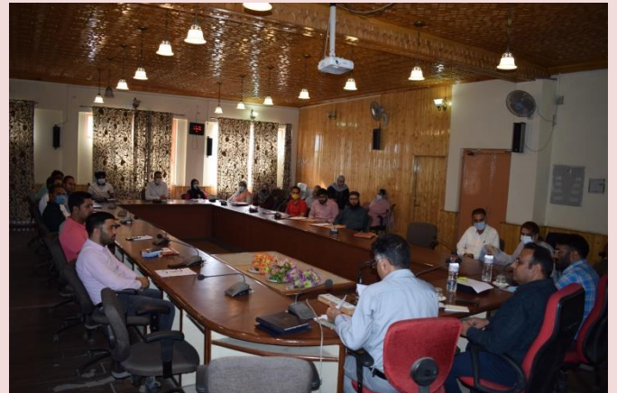
Training Course on "Communication Skills and Community Mobilisation" conducted from November 01-03, 2021, at IMPARD Srinagar