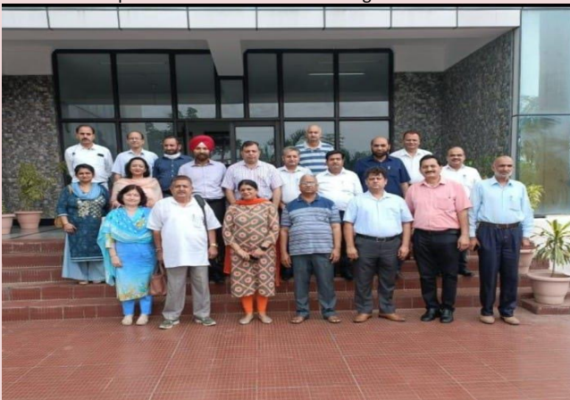
Training Course on "Financial Accounting in Government" conducted from October 04-15, 2021, at IMPARD, Jammu