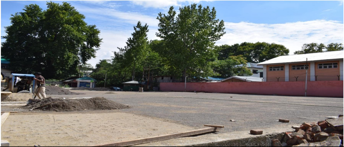
Construction of Car Parking in progress at IMPARD Srinagar