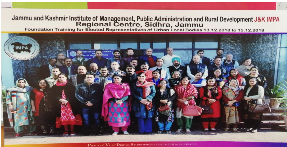
Foundation Training for Elected Representatives of Urban Local Bodies