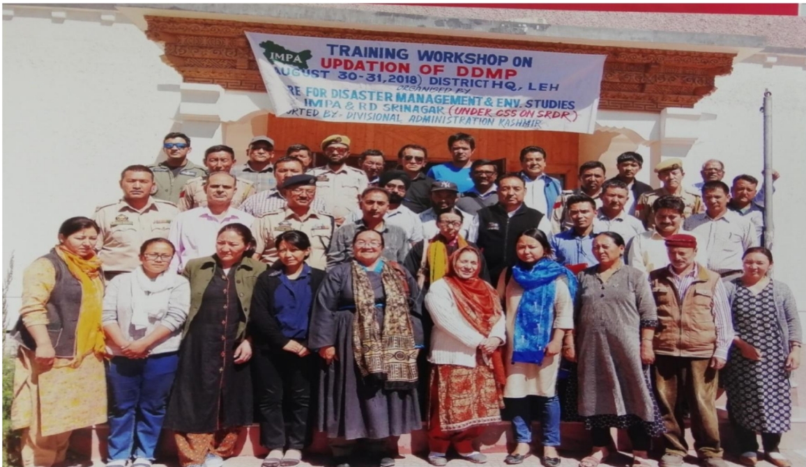
Workshop on 'Updation of DDMP' w.e.f. August 30-31, 2018 at District Head Quarter, Leh

(Uttarakhand, Assam, Bihar, Himachal Pradesh and Jammu and Kashmir). The two districts in Jammu and Kashmir included Anantnag and Poonch. However, some of the activities under the Scheme were extended to other districts especially focussing on Capacity building of different stakeholders. The broad objective of the Scheme is to involve the stakeholders at the district and lower levels including the volunteers and community members in different activities to address Disaster Risk Reduction on a Sustainable basis. It was in this direction that the Divisional Administration Kashmir (Divisional Disaster Management Authority, Kashmir) sponsored a series of events under SRDR wherein a total of 18 events were targeted out of which 16 were completed by end of March, 2019. As such the Centre for Disaster Management & Environmental Studies of the Institute organised a series of events under 3 banners viz Updation of District Disaster Management Plan, Community Based Disaster Management Strategy, and ToT on CBDM. Some of the activities were organised at District Headquarters of Leh, Kargil, Kupwara and Baramulla under the coordinatorship of Dr. G.M. Dar. The participants included district, sub district and other grass root level functionaries as well as the representatives of NGOs and Voluntary Organisations besides some elected representatives of PRI's. A total of 463 participants including 421 males and 42 females attended these 16 events.