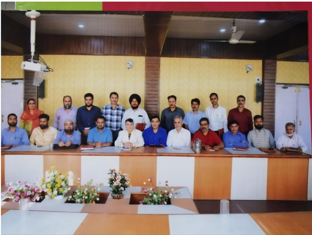
Training Programme on 'Right to Information' being held at IMPARD, Srinagar