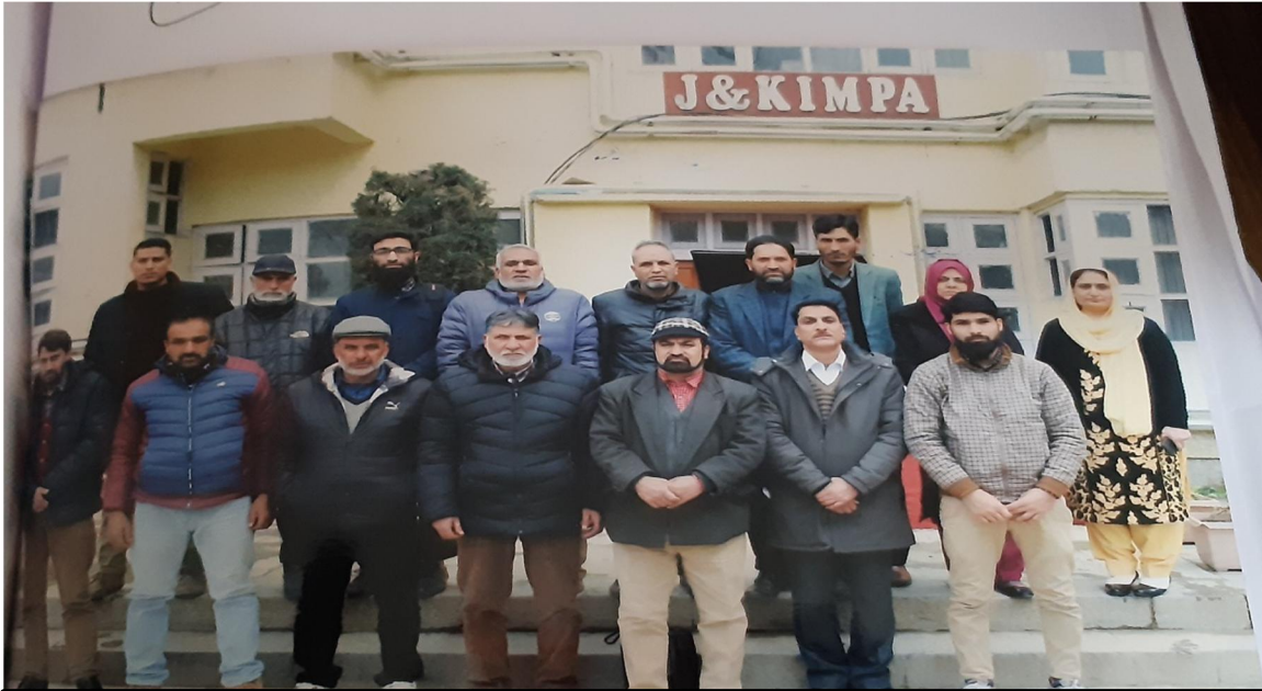
Prevention of Drug Abuse and Combating Drug Addiction