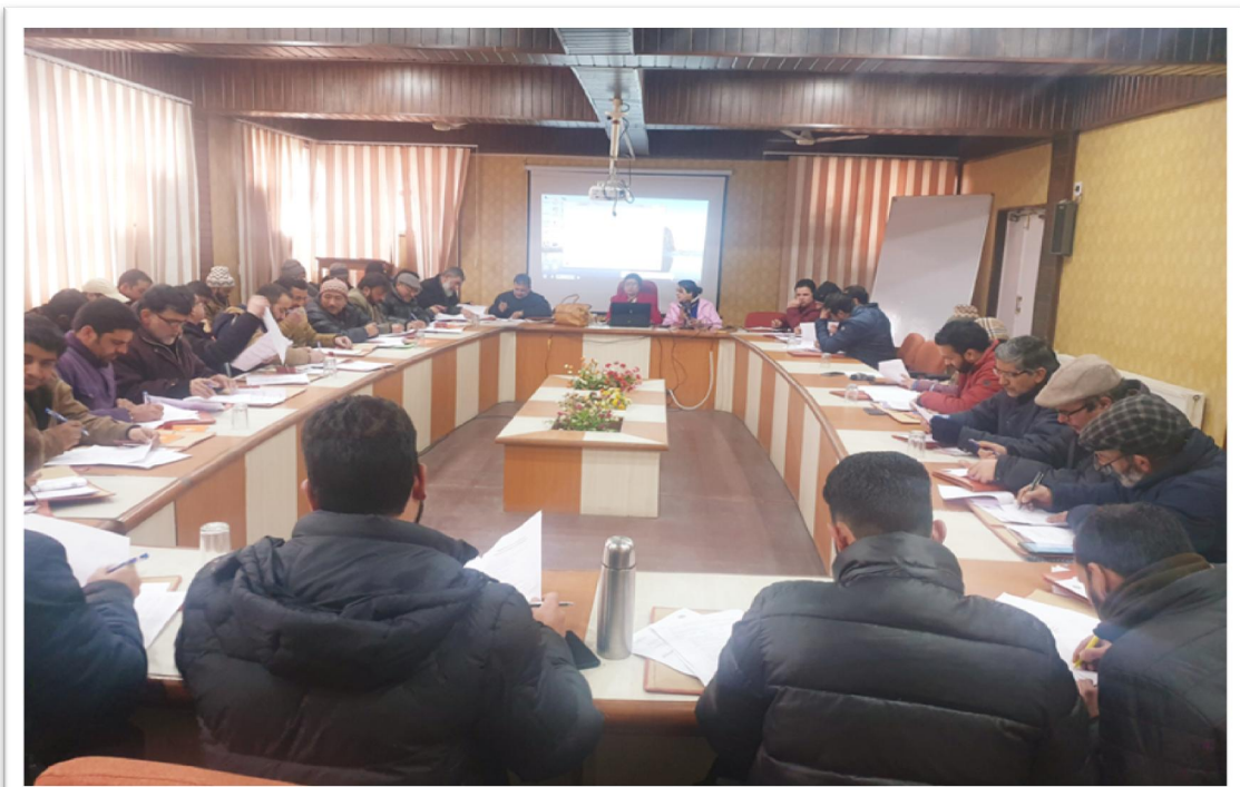
Training Course on ‘Transforming India through Strengthening PRIs by Continuous Training and E-Enablement’ – Session in Progress.

In partial fulfilment of the requirements under the Pan India, the Institute organized a series of nine Training Programmes in collaboration with National Institute of Rural Development (NIRD&PR) and Department of Rural Development on ‘Transforming India through Strengthening PRIs by Continuous Training and E-Enablement’ for the officers/officials of Rural Development Department. The training series aimed at capacity building of the officers/ officials on various aspects of functioning of Panchayati Raj Institutions including provisions of J&K Panchayati Raj Act-1989 and the operational aspects thereof, and the instruments of devolution of powers and functions to Halqa Panchayats and their execution. During the training, an assessment of the trainees was made on different parameters in order to utilize their services as Departmental Resource Persons (DRPs) to enable them to further train the PRIs in the cascading mode.